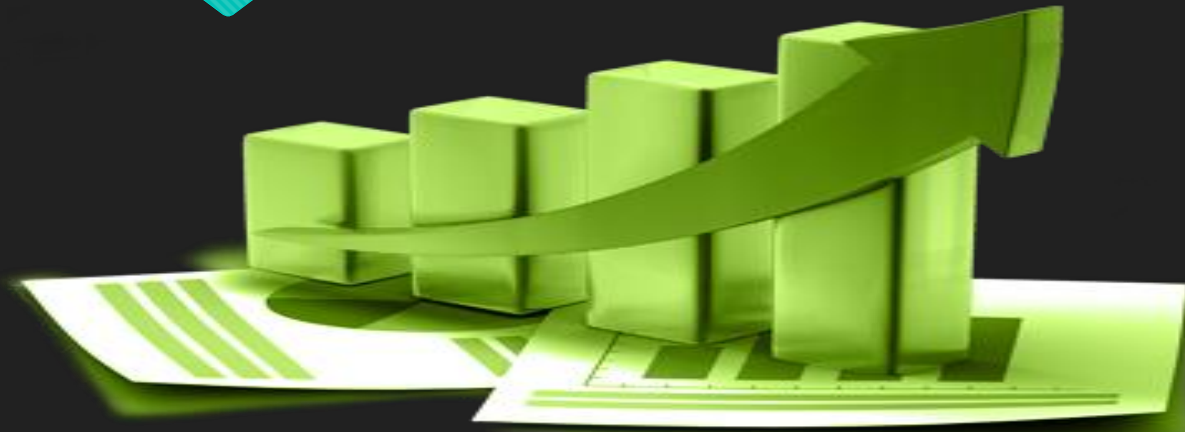
Chart-Master FX [Think like an institutional trader]