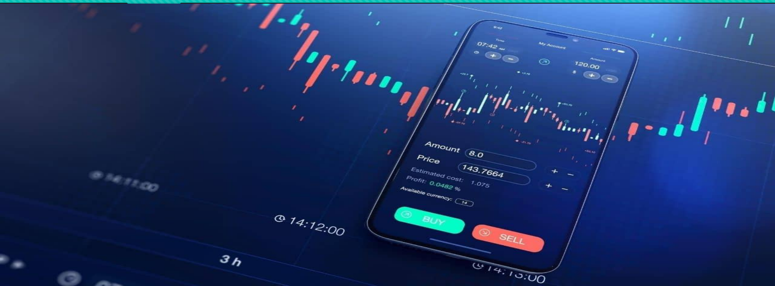
Chart-Master FX [Think like an institutional trader]