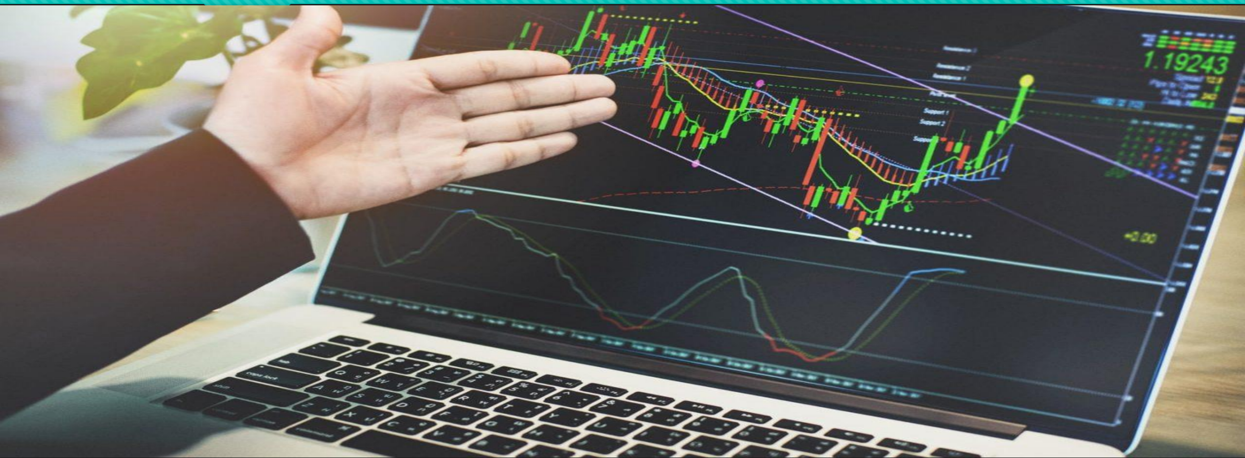
Chart-Master FX [Think like an institutional trader]