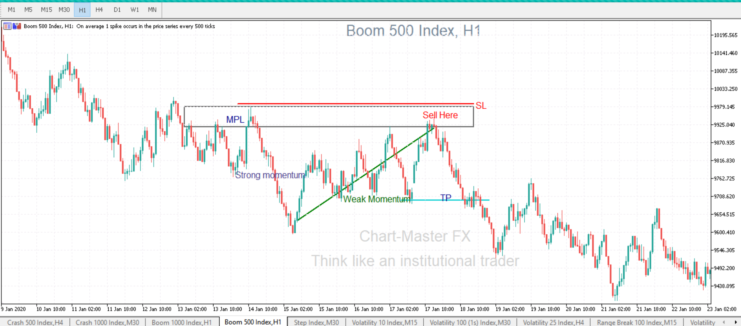
Chart-Master FX [Think like an institutional trader]